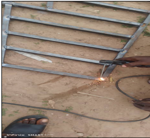
A3: Welding Process