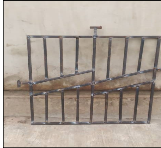
A4: Fabricated 4ft x 4ft mild steel pipe before painting