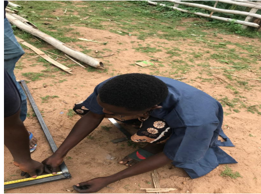
A2: Measuring Process