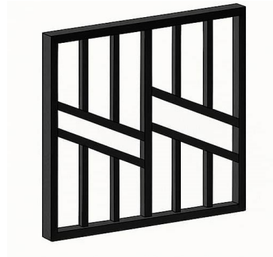
Fig 4.2 3D design