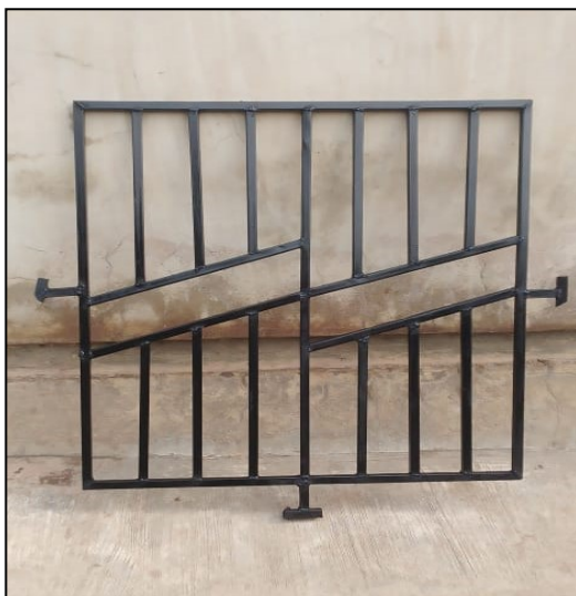
A5: Fabricated 4ft x 4ft mild steel pipe after painting