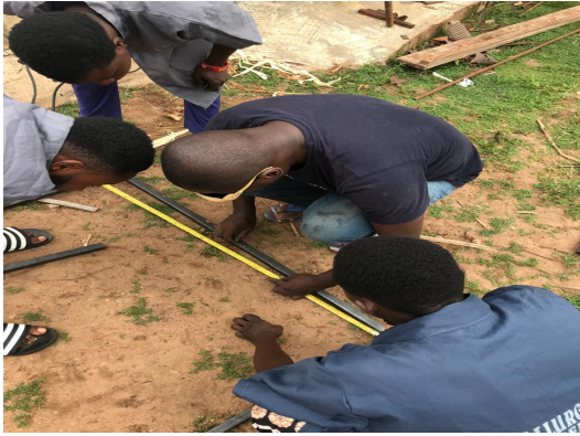
A1: Measuring Process