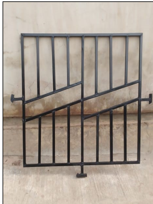
Fig 4.5 Fabricated 4ft x 4ft mild steel pipe after painting