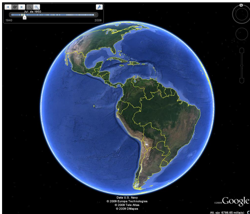
Figure 2.3: Google Earth globe

Maps API usage, and if the usage exceeds 25,000 map views a day, Google will contact and present charges. Google Maps API for Business 7 is a paid version of Google