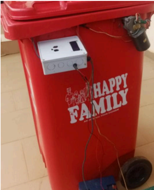
Figure 4.1: Trash can A trash can, also known as a garbage can, waste bin, or rubbish bin, is a container used to hold refuse until it is collected and disposed of.