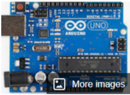
Figure 4.3: Arduino Uno

The Arduino Uno is a popular microcontroller board based on the ATmega328P microcontroller. It is widely used for a variety of projects and applications due to its ease of use, versatility, and extensive community support.