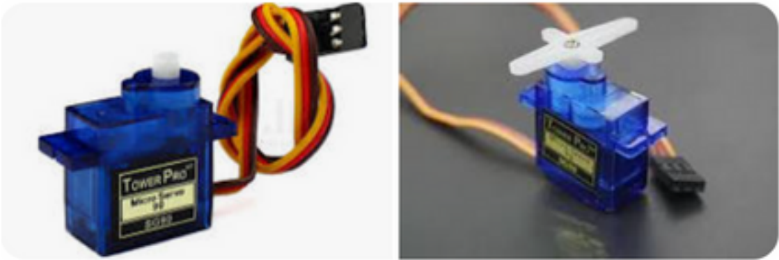
Figure 4.2: Servomotor

A servomotor is a closed-loop servomechanism that uses position feedback (either linear or rotational position) to control its motion and final position.