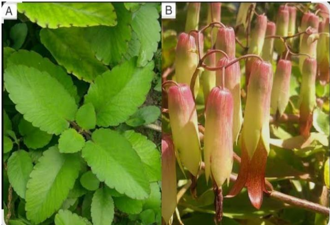
Fig 1 Description of Bryophyllum pinnatum flower and leaves