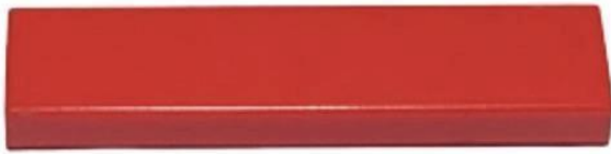
FIG 1.1: Alnico magnet

NOTE: Neodymium magnets, Alnico magnets and ferrite magnets are under permanent magnets.