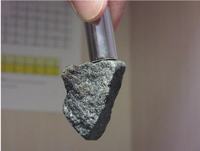
FIG 1.0: A magnetite rock is being pulled by a neodymium magnet on top.

A magnet is a material or object that produces a magnetic field. This magnetic field is invisible but is responsible for the most notable property of a magnet: a force that pulls on other ferromagnetic materials, such as iron, steel, nickel, cobalt, etc. and attracts or repels other magnets.