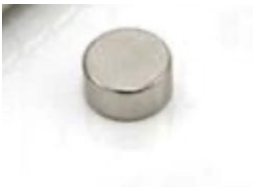
FIG 1.2: Neodymium magnet