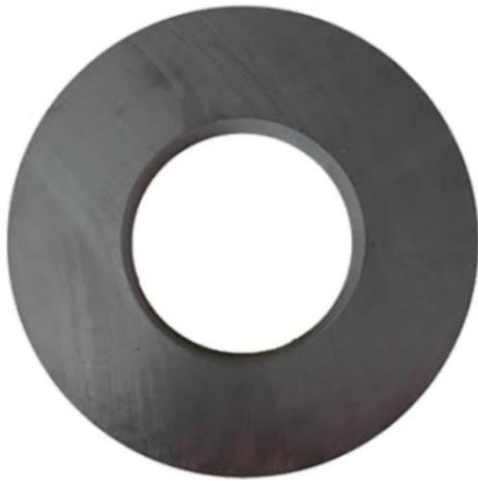
FIG1.3: Ferrite magnets

A magnetic field, sometimes known as a B-field, is a physical field that affects electric charges, currents, and magnetic materials. A moving charge in a magnetic field receives a force that is perpendicular to both its velocity and the magnetic field. The magnetic field of a permanent magnet attracts or repels other magnets, as well as ferromagnetic elements like iron. Furthermore, a nonuniform magnetic field exerts microscopic forces on "nonmagnetic" materials via three other magnetic effects: paramagnetism, diamagnetism, and antiferromagnetism, but these forces are typically so minute that they can only be measured by laboratory equipment. Magnetic fields surround magnetised objects, as do electric currents and fluctuating electric fields throughout time. Because the strength and direction of a magnetic field can change depending on where it is, it is mathematically defined by a function called a vector field, which assigns a vector to each point in space. (Nave R. 2024)