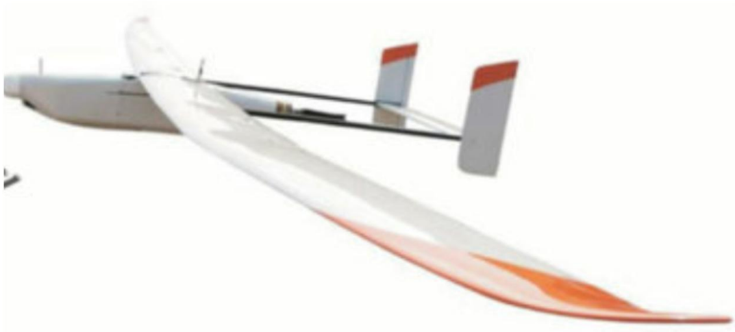
Figure 4.4: Enclosures

This is the Weatherproof enclosures of the system to protect cameras and sensors. It also shield components from dust, moisture, and chemicals and provide durability in harsh terrains.