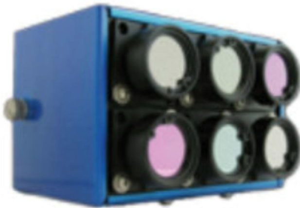
Figure 4.5: Tetracam Mini MCA-6

This is the Weatherproof enclosures of the system to protect cameras and sensors. It also shield components from dust, moisture, and chemicals and provide durability in harsh terrains.