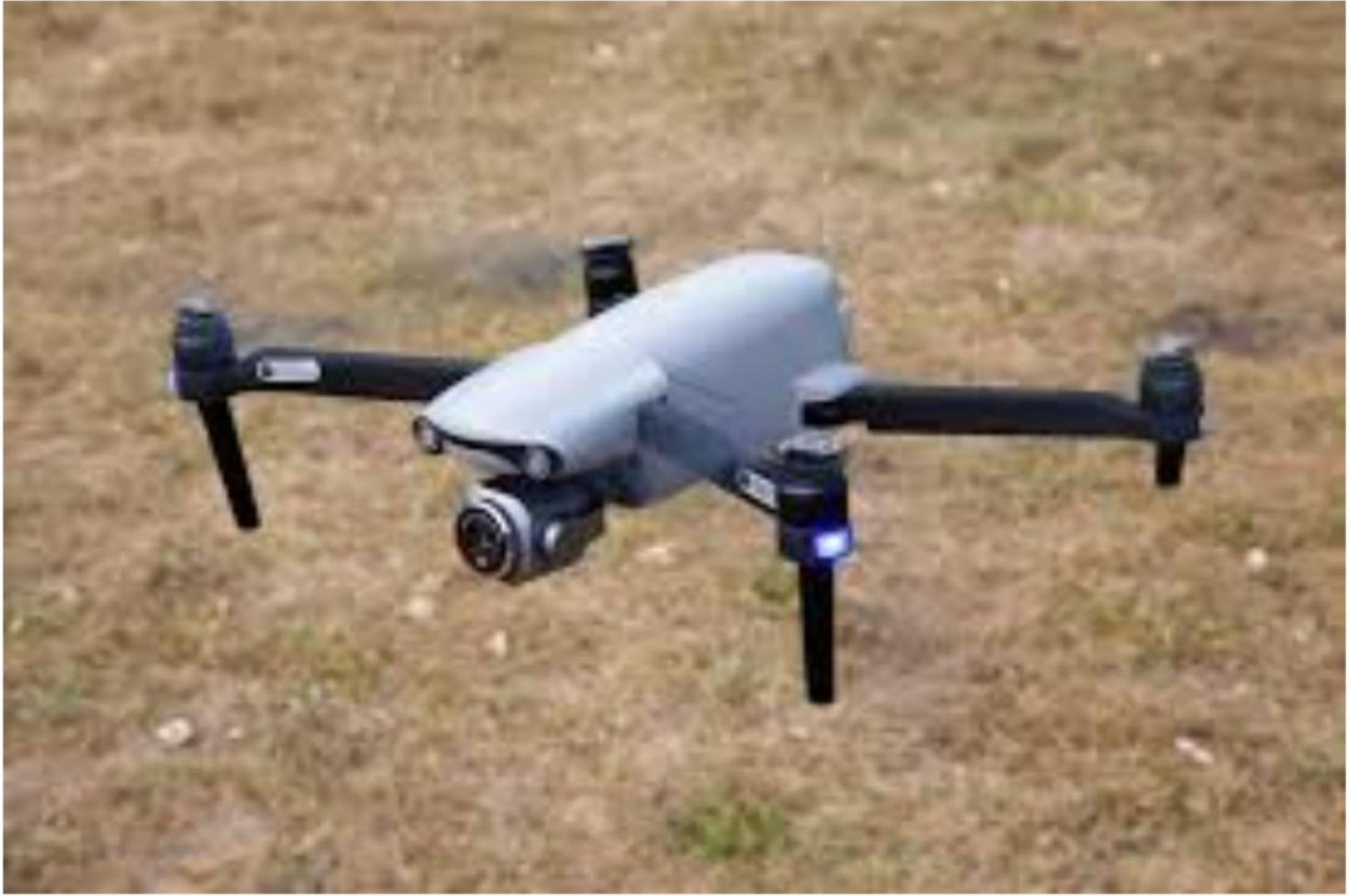
Figure 4.1: The Drone Surveillance System

The picture above is the AI based drone operation with surveillance system. The users or the administrator should be able to inspect an area when an abnormal situation is detected by the system. The drone has the ability to provide video stream to the users or administrator on request. However, since the bit rate of a video is quite high, the researchers employed a video rate adaptation to fully utilize the network. The surveillance module reports the video stream information to GCS whenever there is a request of video stream service.