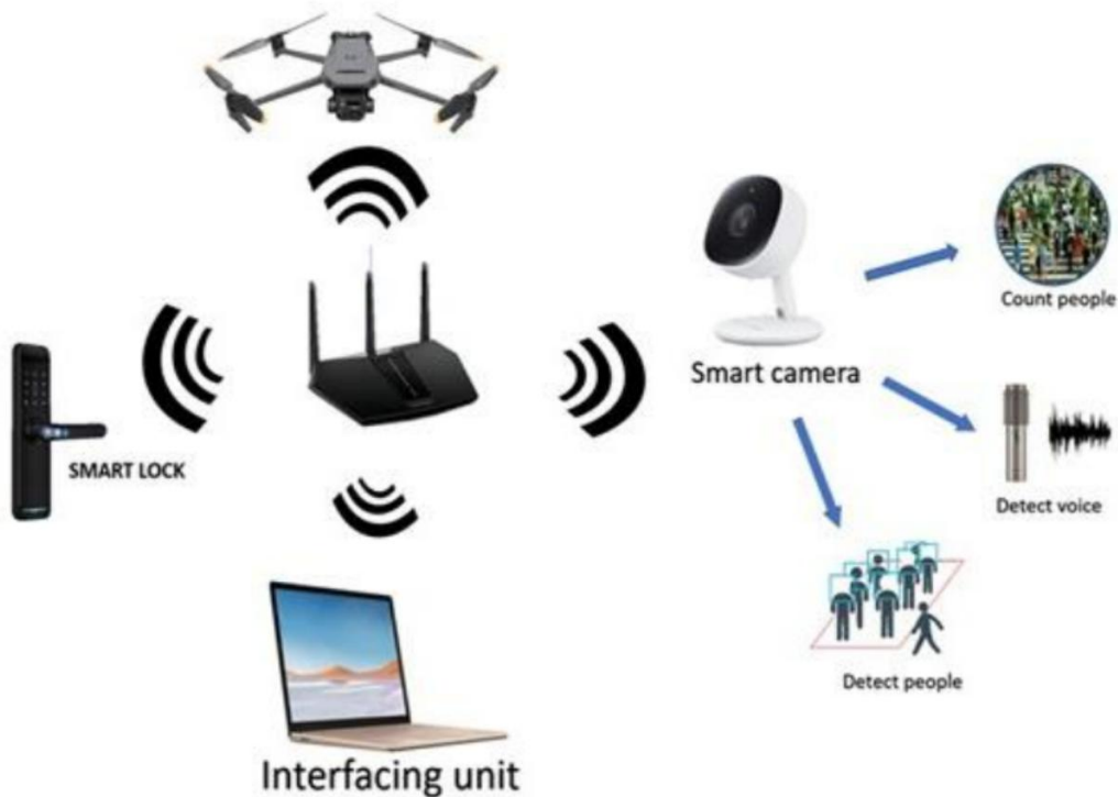
Figure 3.1: Smart AI-based Drone Security System Prototype

The researchers' guideline to build a fleet starts with the instructions to build a programmable Unmanned Aerial Vehicles (UAVs). Three main components of the system are the UAVs, a server, and the fleet platform. The fleet platform is a software developed to integrate multiple UAVs for an easier management. The concept of the UAVs and the server is both hardware and software, which will be fully covered in this chapter. In short, the UAVs act as probes that collect information of a designated area of interest, the server gathers, processes, and presents the information from UAVs, and the fleet platform provides a network and management. Overview of the proposed system is shown in Figure 3.1 below.