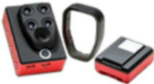
Figure 4.7: Parrot Sequoia

Calibration panels are essential tools in drone-based imaging, particularly for applications involving remote sensing, photogrammetry, and multispectral imaging. These panels ensure the accuracy and consistency of data collected by drone sensors, enabling reliable analysis and decision-making.