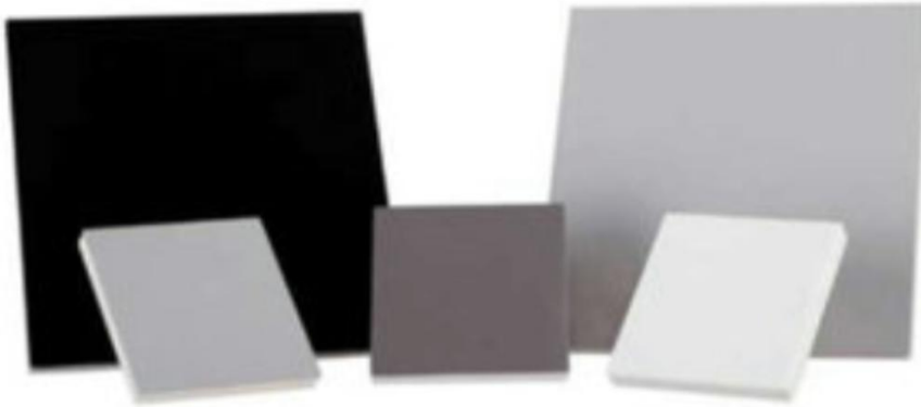
Figure 4.5: Calibration Panels

health, environmental monitoring, and other applications where spectral information is critical.