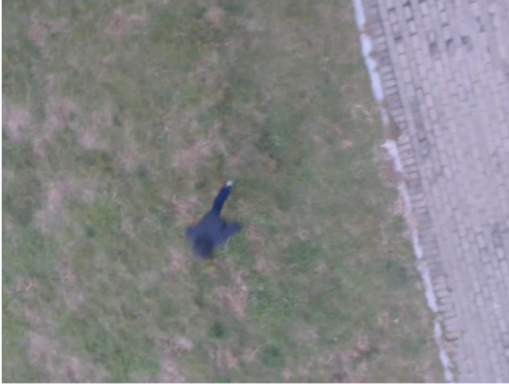
Figure 4.3: An Object Captured by the Drones during Surveillance

This is an image captured by the drones during the day surveillance with the help of the camera and sensors.