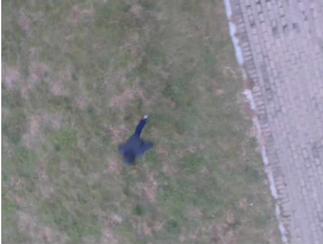
Figure 4.3: An Object Captured by the Drones during Surveillance

This is an image captured by the drones during the day surveillance with the help of the camera and sensors.