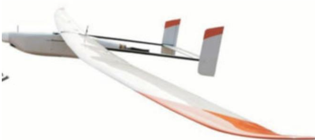
Figure 4.4: Enclosures

The system integrates ground-based IoT sensor networks that continuously monitor soil moisture levels at varying depths, microclimate conditions through distributed weather stations, and nutrient sensors embedded in the soil. These terrestrial inputs provide crucial context to the aerial data, creating a complete picture of field conditions. Farmers can supplement this automated data collection with manual inputs through the management interface, including crop rotation histories, irrigation schedules, and previous treatment records.