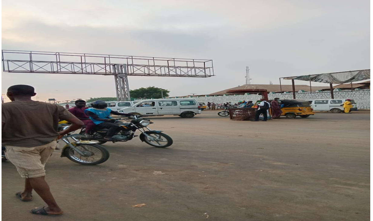
Figure 3.3: The data collection was carried out over a period of seven consecutive days