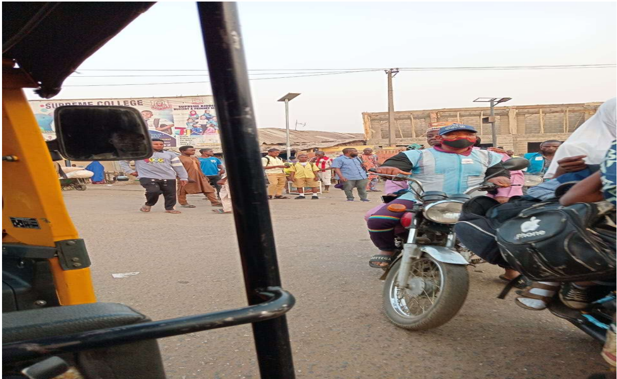
Figure 3.2 Scenario at Maraba junction