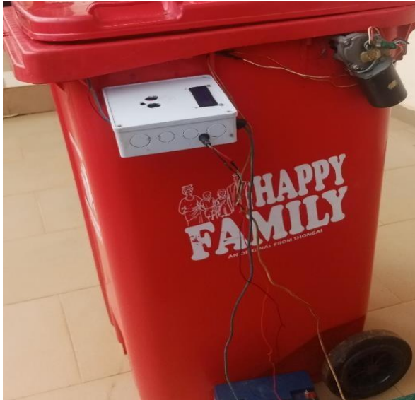
Figure 4.1: Trash can

A trash can, also known as a garbage can, dustbin, or rubbish bin, is a container used to hold refuse until it is collected and disposed of.