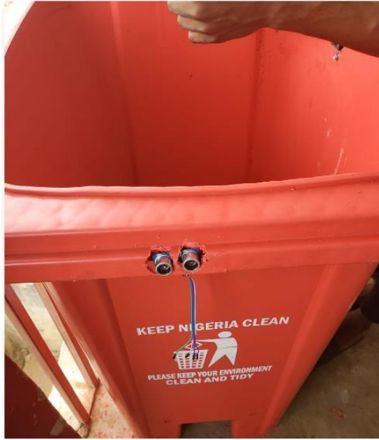
Figure 4.4: Smart Dustbin

A smart dustbin is an advanced trash receptacle equipped with various technologies to enhance waste management efficiency and user convenience. These bins typically incorporate sensors, connectivity features, and automation to provide a more sustainable and intelligent waste disposal solution.