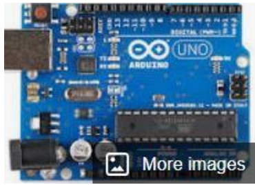
Figure 4.3: Arduino Uno

The Arduino Uno is a popular microcontroller board based on the ATmega328P microcontroller. It is widely used for a variety of projects and applications due to its ease of use, versatility, and extensive community support.