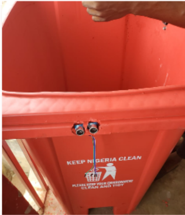
Figure 4.4: Smart Dustbin

A smart dustbin is an advanced trash receptacle equipped with various technologies to enhance waste management efficiency and user convenience. These bins typically incorporate sensors, connectivity features, and automation to provide a more sustainable and intelligent waste disposal solution.