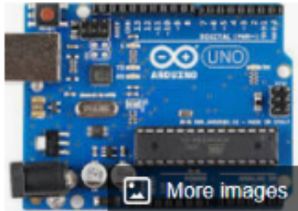
Figure 4.3: Arduino Uno

The Arduino Uno is a popular microcontroller board based on the ATmega328 P microcontroller. It is widely used for a variety of projects and applications due to its ease of use, versatility, and extensive community support.