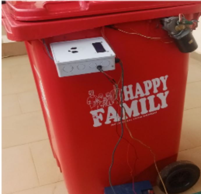
Figure 4.1: Trash can

nagement. Things taken into consideration in determining the output are represented below: