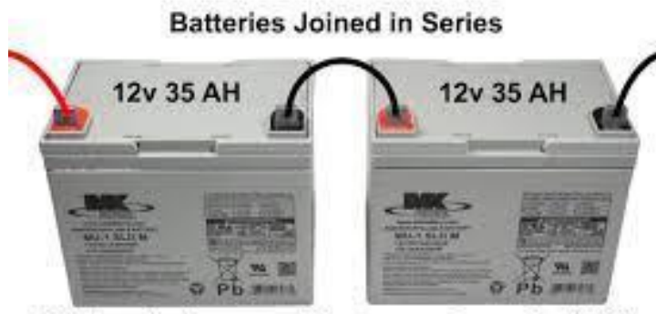
Fig. 2.4: Batteries Connection

If the goal of the connection is to increase capacity and prolong the runtime of the inverter, batteries can be connected in parallel, as shown in Figure 2.5. This increases the overall Ampere-hour (Ah) rating of the battery set.