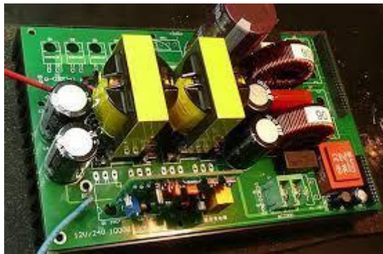
Fig. 2.1: Inverter inner circuitry.

An inverter is a device that converts DC power from sources such as batteries into AC power. In a solar-powered inverter system, the DC power is sourced from solar panels. Figure 2.1 shows the inner circuitry of an inverter power system.