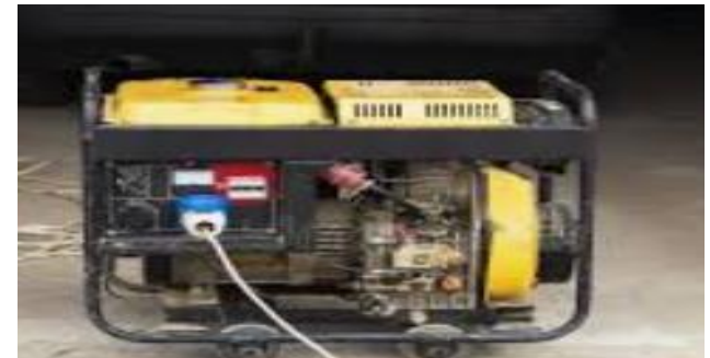
Figure 2: Gasoline Generator