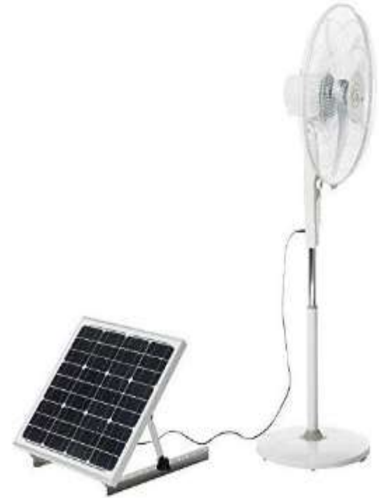
Figure 2: Solar Powered Standing Fan