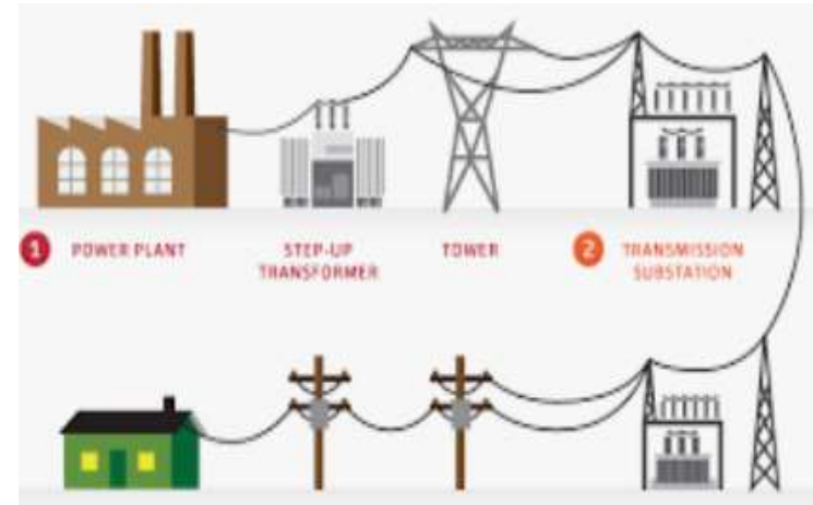
Figure 1: Simple Transmission Line