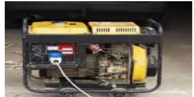
Figure 2: Gasoline Generator