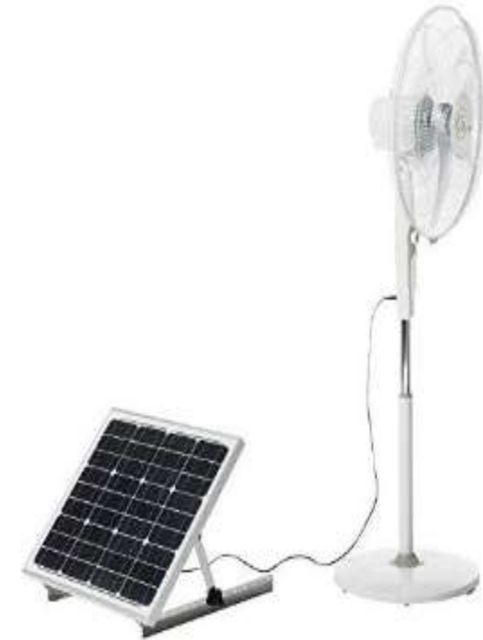
Figure 2: Solar Powered Standing Fan