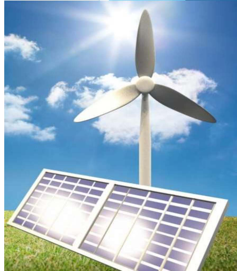
Figure 1: Samples of Renewable Energy.

This is feasible because our regions has considerable solar insolation, the use of solar energy for everyday applications is not only environmentally friendly but also economically beneficial.