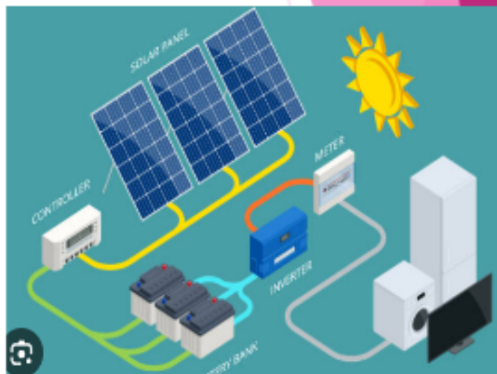
Figure 1: Standalone Inverter System