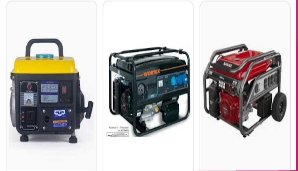
Figure 2: Gasoline Generator Sets