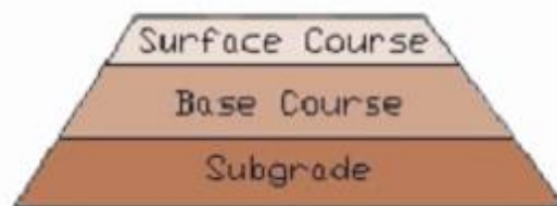
Fig 2. Section of Rigid Pavement