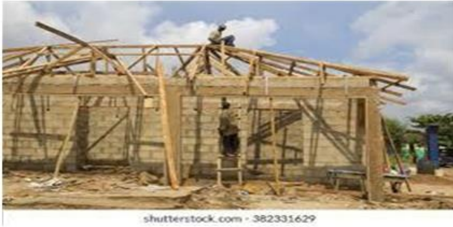
Construction and site activities 1