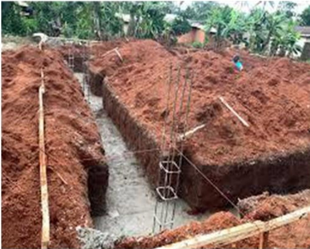
Process of setting out

The first thing we need to a parallel/reference/ base line, to which all other lines can be related. This can be taken along an existing close to the proposed new structure/boundary wall if existing/keeps line. e.t.c