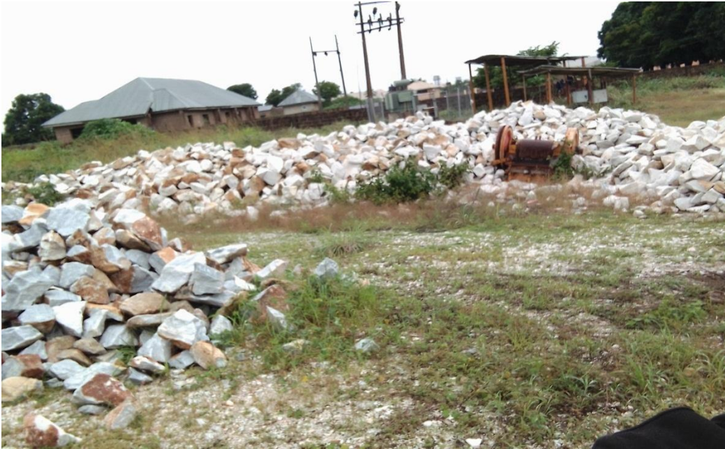
Marble stones persevered at the processing site