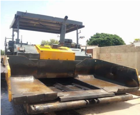
Pneumatic finisher ready for use

In the overlay process, if the hot mix asphalt pavement cools too quickly, the entire surface will ravel living a rough, rocky surface in a short period of time. For the compaction of the newly over-laid asphalt, smooth wheel and pneumatic rubber tyre rollers are used. The smooth wheel roller compacts it first, water is sprayed to the wheel so that the asphalt does not stick to the wheel during the compaction process.