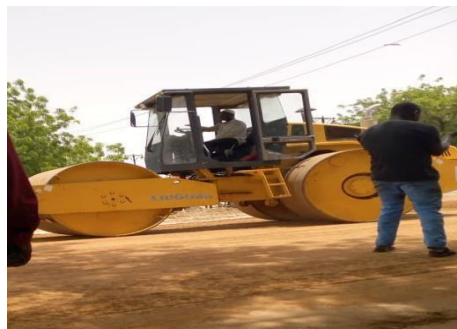
Drum wheel roller