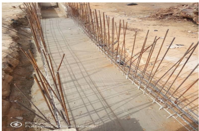
Arranged re-bars with concrete base