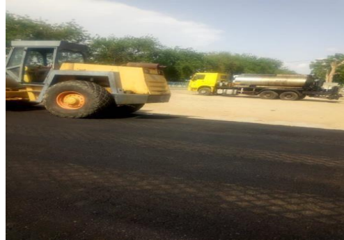
compaction of laid asphalt