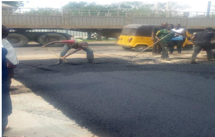
Workers spreading asphalt