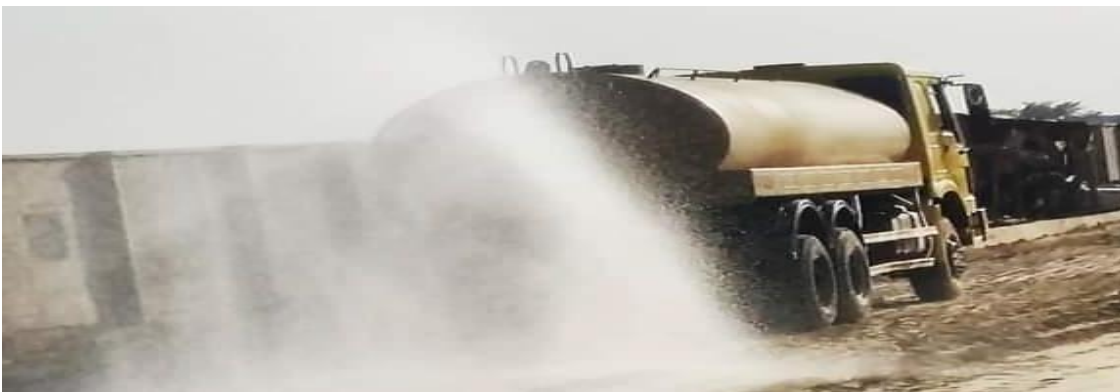
spraying of water by the water bauxer

Water is sprayed on the laterite to give it the required moisture just enough to allow maximum compaction. Also water is sprayed after compaction of laterite when there will be another layer of laterite to be laid on the current layer to create bond between the two layers.