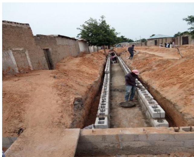
Block drainage under construction