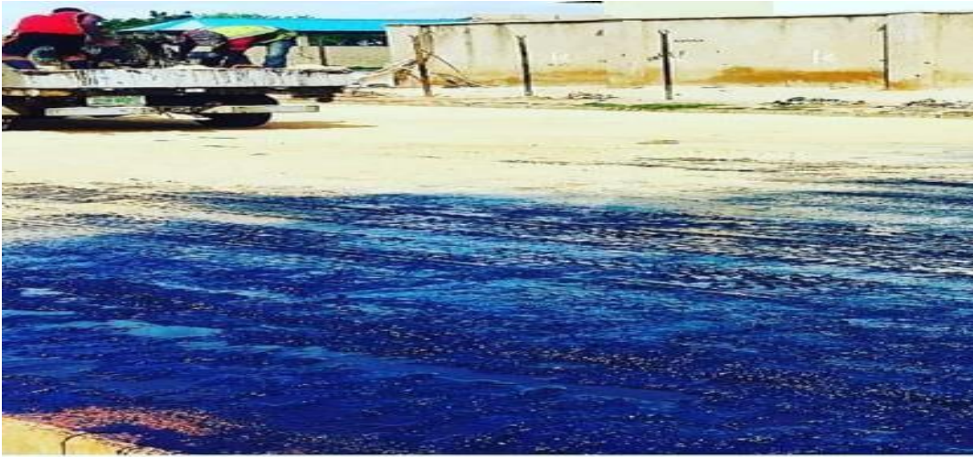
Blinding of the primed surface using quarry dust