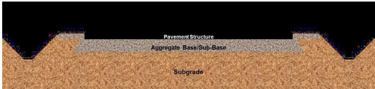
Road Cross section