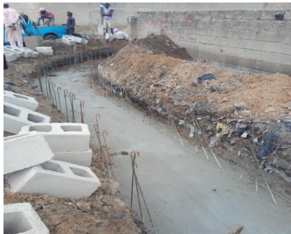
Blinding and concrete base