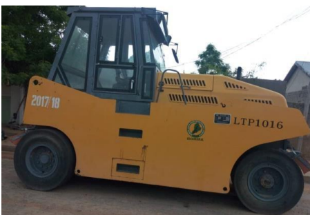
Pneumatic rubber tyre roller