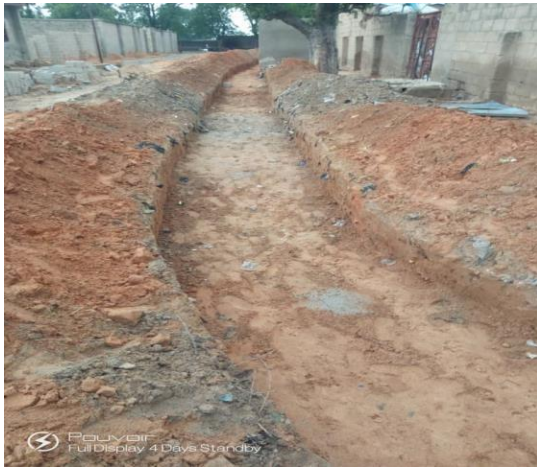
Excavated Drainage trench Plate

The provision of turnouts or cut-off drains should also be considered to reduce or control the amount of water in the side drains. Costing may need to take account of these and the need to line drains with masonry or concrete in highly erodible soils.