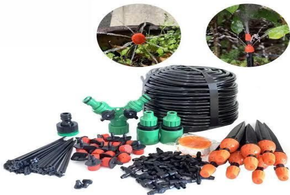
Materials used during their irrigation practical