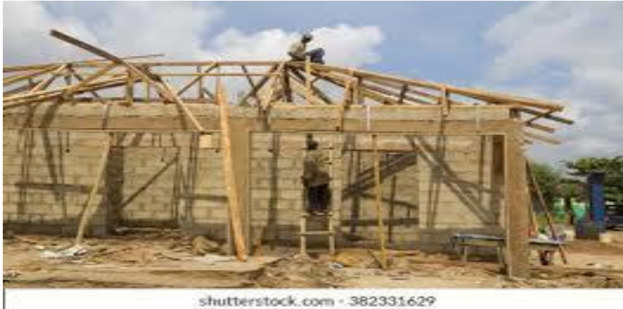
Construction and site activities 1