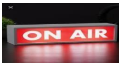
Fig 2.1.5: Air Light