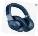
Fig 2.1.2: Head phone