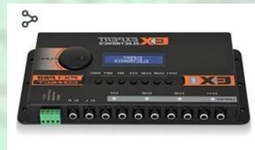
Fig 2.1.7: Audio Processor