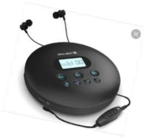
Fig 2.1.3: CD Player

from a button on the audio console. I was expected to know which button is to be pressed to play the pre-recorded audio on the audio console, and also to know how to start the pre-recording audio.