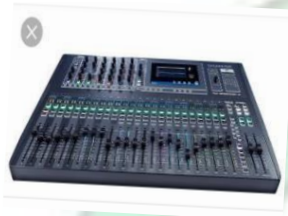
Fig 2.1.1: Audio console