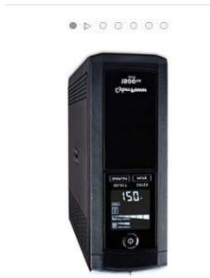
Fig 2.1.6: UPS