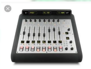
Fig 2.1.4: Mix Engine