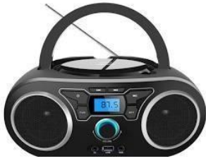
CD Player (Radio)