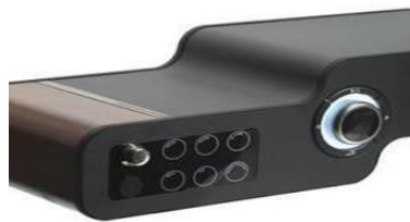
Audio Monitor (Radio)