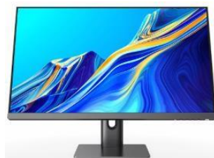
Computer Monitor (Radio)