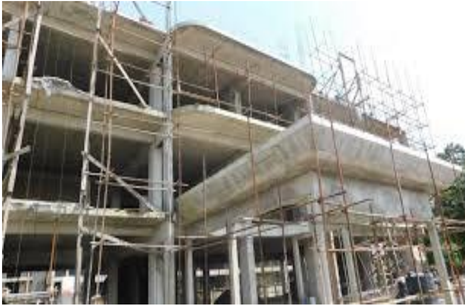
Construction and site activities 2