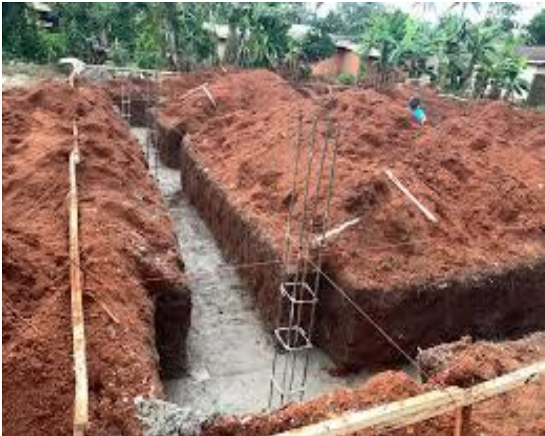
Process of setting out

The first thing we need to a parallel/reference/ base line, to which all other lines can be related. This can be taken along an existing close to the proposed new structure/boundary wall if existing/keeps line. e.t.c