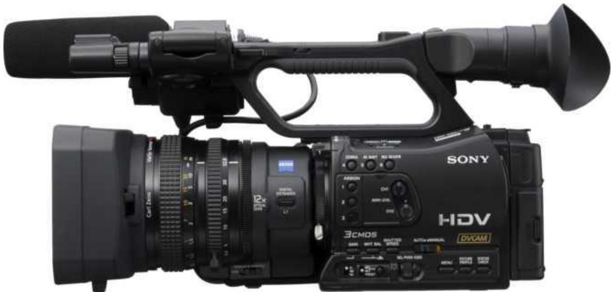
Z5 HD CAMERA