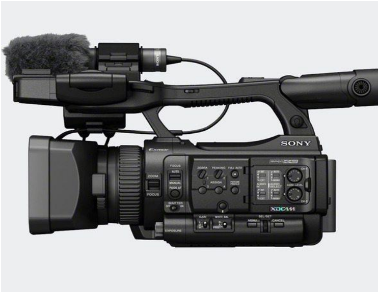
4k HD Sony camera

In camera unit I was taught basic effect to be applied to a camera which could be seen as configurations before a coverage or production is been taking place and the type of camera been used in GVTV.