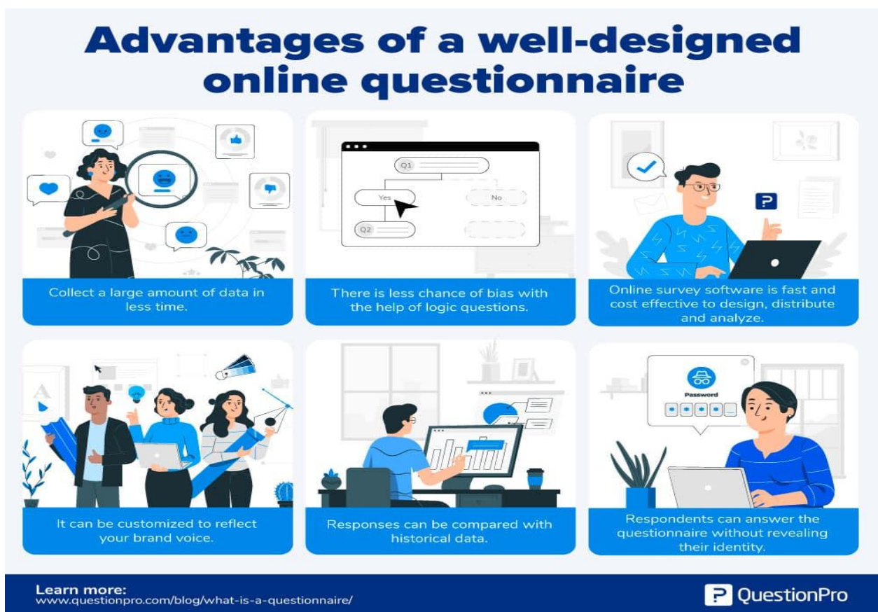
✓ FIG1. 3.1.2 IMAGE SHOWING THE ADVANTAGE OF A GOOD QUESTIONNAIRE

Open-ended, long-form questions offer the respondent the ability to elaborate on their thoughts. Research questionnaires were developed in 1838 by the Statistical Society of London.