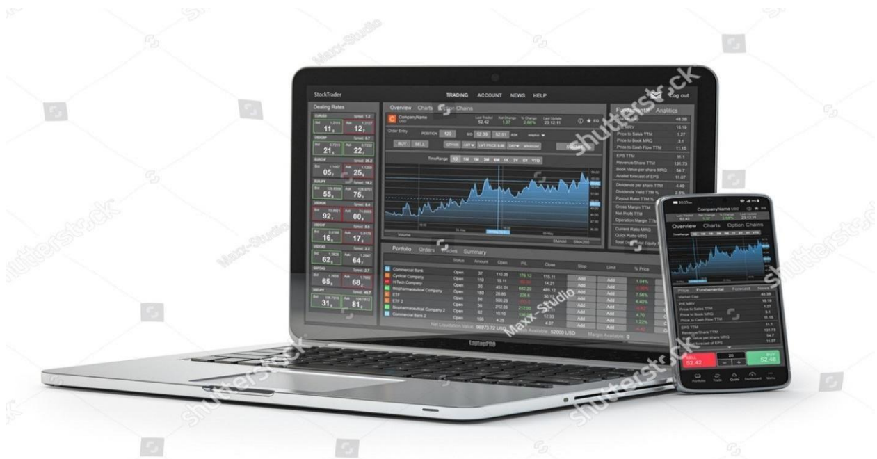
Diagram showing studio laptop

I was taught that a recording studio is a specialized facility for sound recording, mixing, and audio production of instrumental or vocal musical performances, spoken words, and other sounds. They range in size from a small in-home project studio large enough to record a single singer-guitarist, to a large building with space for a full orchestra of 100 or more musicians. Ideally, both the recording and monitoring (listening and mixing) spaces are specially designed by an acoustician or audio engineer to achieve optimum acoustic properties (acoustic isolation or diffusion or absorption of reflected sound echoes that could otherwise interfere with the sound heard by the listener).