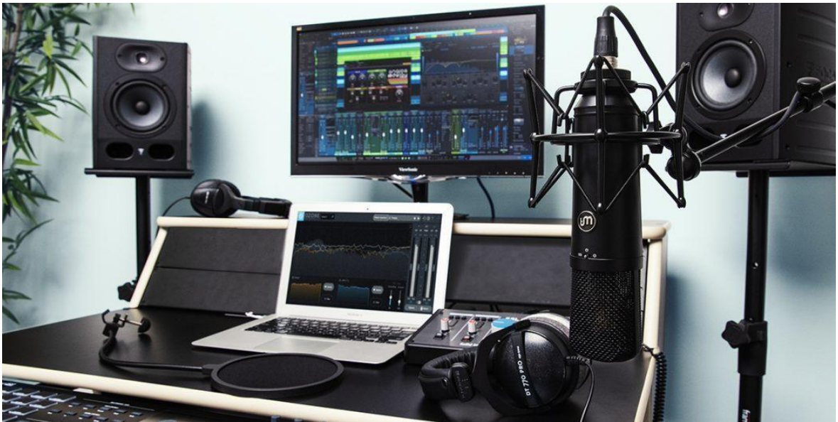
Diagram showing Studio Equipment