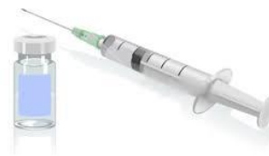
Syringe and needle