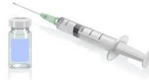
Syringe and needle