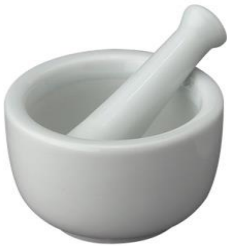
Mortal & Pestle