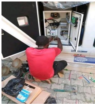
A Switch Gear