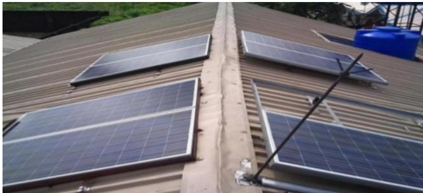
Rooftop Installation of Solar Energy