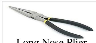
Long Nose Plier