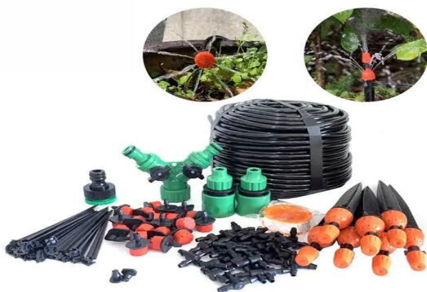
Materials used during the irrigation practical