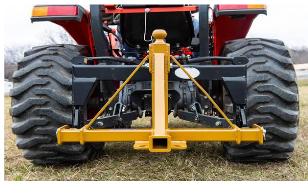
TRACTOR THREE POINT LINKAGE