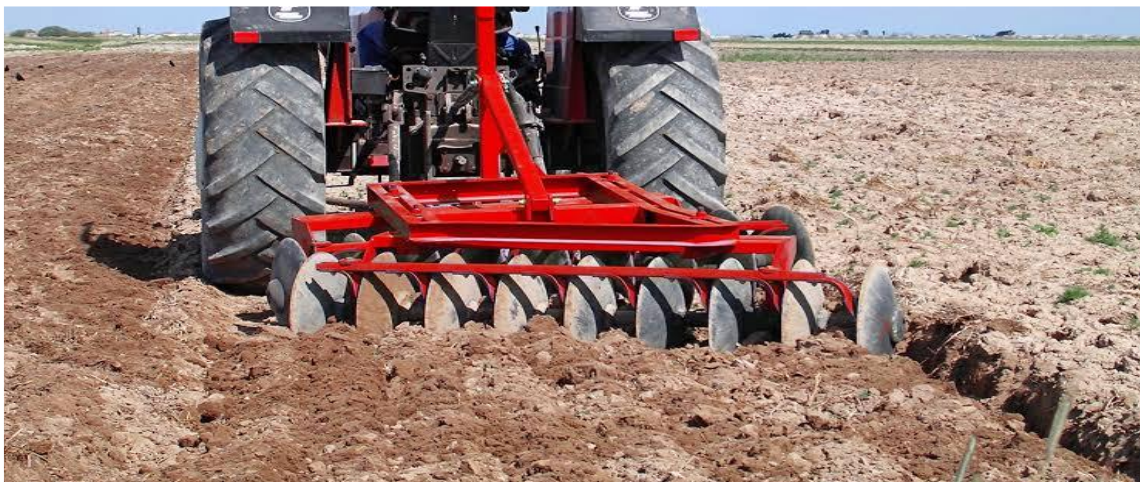
THE DISC HARROW WORKING PERFECTLY AFTER THE REPAIR