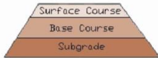
Fig 2. Section of Rigid Pavement